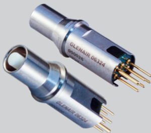
050-307 Radiation Tolerant